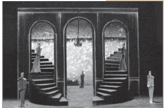
Roméo et Juliette set design, Act I

“I want to focus on what is timeless in the piece, and make it seem as if it could happen today...”