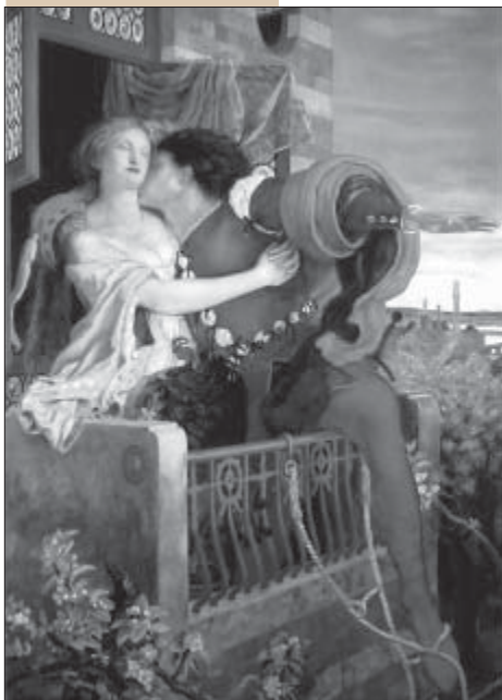
A traditional portrayal of Romeo and Juliet, in an 1870 painting by Ford Madox Brown.