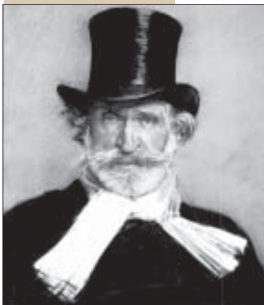
Giuseppe Verdi, in an 1886 painting by Giovanni Boldini